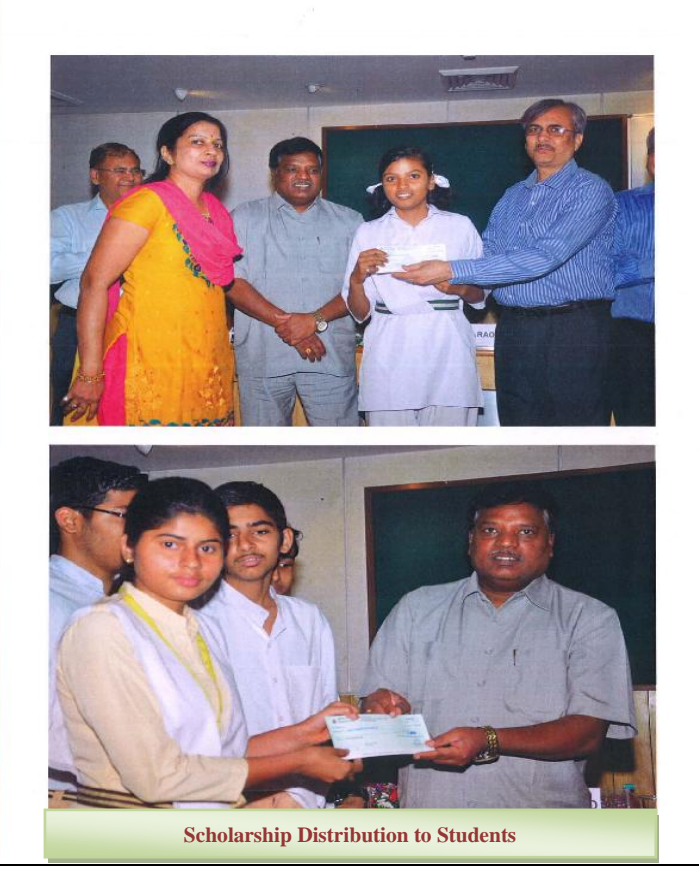
Corporate Social Responsibility and Sustainability Initiatives POSOCO

The scholarship were awarded to the students belonging to the SC/ST/OBC/PH category who have passed 10th Exam of CBSE in the year 2012, and studying in class 11th during the year of 2013 in schools of Govt. of Delhi.